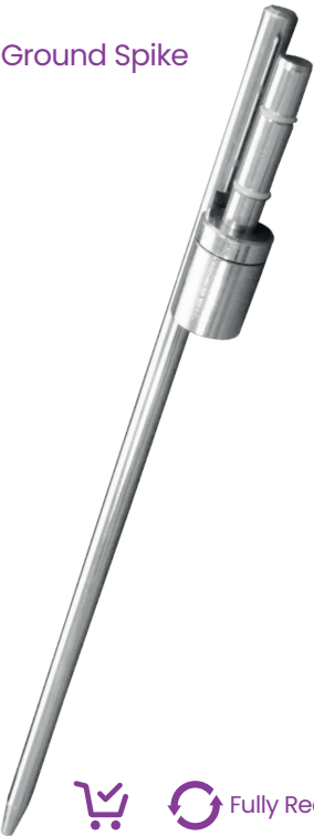
Ground Spike Diagram

Note: if considering an angled mount for a shop or building frontage then we recommend use of small Teardrop Flying Banners only - to avoid flag damage against the wall in the event of wind rotation.